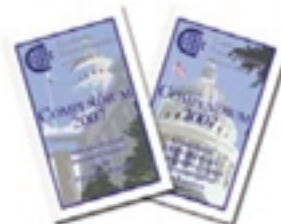
Freelance & Official Compendiums = $25