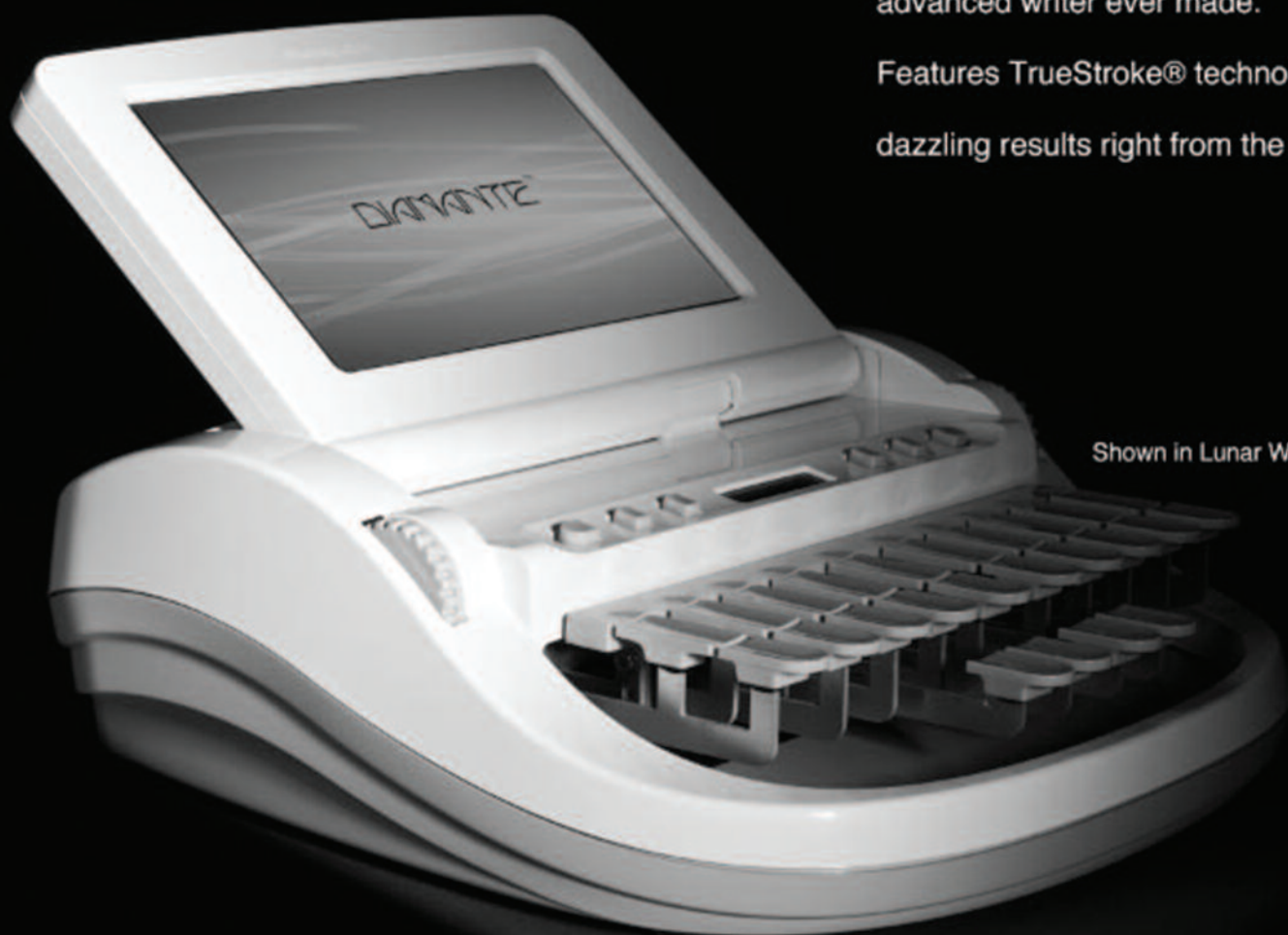
Shown in Lunar White

Features TrueStroke® technology to give you dazzling results right from the start.