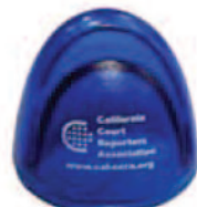
Paper Holder = $5