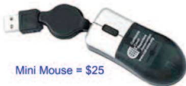
Mini Mouse = $25