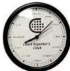
Wall Clock = $20