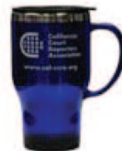
Travel Mug = $15