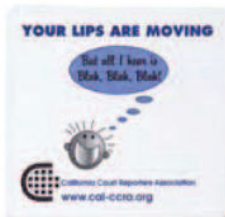
Mouse Pad = $15