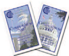
Freelance & Official Compendiums = $25