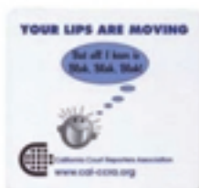
Mouse Pad = $15