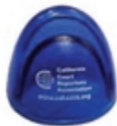
Paper Holder = $5