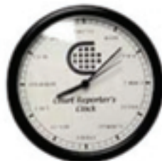
Wall Clock = $20