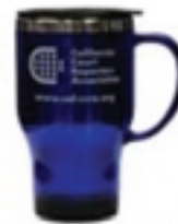
Travel Mug = $15