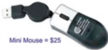
Mini Mouse = $25