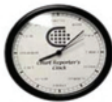
Wall Clock = $20