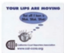
Mouse Pad = $15