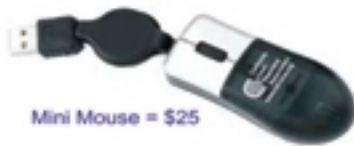
Mini Mouse = $25