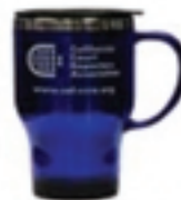
Travel Mug = $15