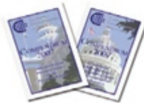
Freelance & Official Compendiums = $25