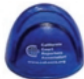
Paper Holder = $5