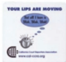
Mouse Pad = $15