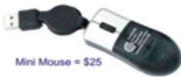
Mini Mouse = $25