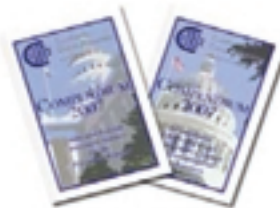
Freelance & Official Compendiums = $25