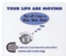
Mouse Pad = $15