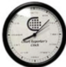
Wall Clock = $20