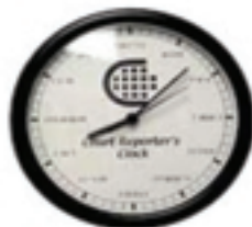
Wall Clock = $20