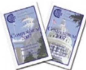
Freelance & Official Compendiums = $25